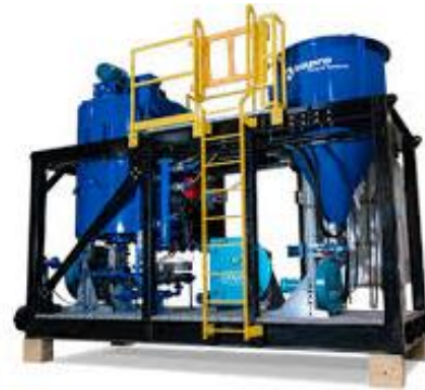
Leaching unit for boric acid extraction

Accumulated sludge containing boron trapped on the surface of sand filter will periodically discharge to an sludge holding tank by normal backwash sequence of the filters. The sludge then will continuously pump to leaching unit specially designed for extraction of precious boric acid