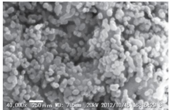
Nano porous surface of MC2200™ material

The key element in OTOBOR™ technology is our novel mineral based MC2200™ which is an highly porous Nano absorbent with ability to make flocks bigger than 100 µm. Suitable to remove via conventional sand filters. Following table briefly shows properties of the media.